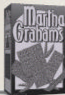
A misconception. Not to mention an overlooked marketing opportunity.

H ardly a fitting legacy for the woman who, despite getting a late start at the positively elderly age of 17, became