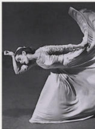
Ms. Graham told stories using movement. Here, she tells us how sad it is that kids aren't getting enough art.

She did nothing less than create an entirely new genre of dance, while shattering the expectations of audiences and critics alike with her percussive, angular movement style. She was one of the first dancers to collaborate with contemporary composers instead of using the 18th- and 19th-century compositions her predecessors favored. Her dances have been called "motion pictures for the sophisticated"; her theories on movement and kinesthetics are still vital today; and there is scarcely a dancer alive who doesn't