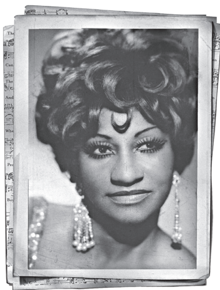
The undisputed Queen of Salsa. Funny, she doesn't look like a hot sauce.

as men. And when she immigrated to the United States, she joined forces with the Latin headliner Tito Puente. But it was in 1973 at Carnegie Hall when Celia burst onto the concert stage wearing flamboyant