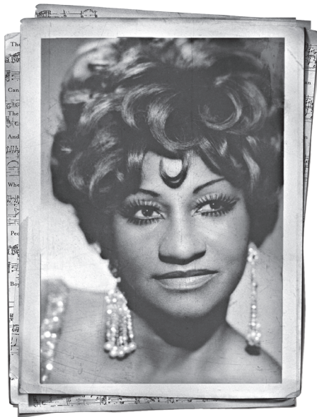
The undisputed Queen of Salsa. Funny, she doesn't look like a hot sauce.

But it was in 1973 at Carnegie Hall when Celia burst onto the concert stage wearing flamboyant