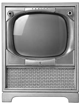
If you're looking for Caravaggio, you're very, very cold.

It's quite hard to believe. Here's a 16th-century Baroque master whose bold naturalistic painting style first created a sensation, then a movement. A guy whose life was filled with the turbulence and excess of a dozen Mario Puzo novels. A guy