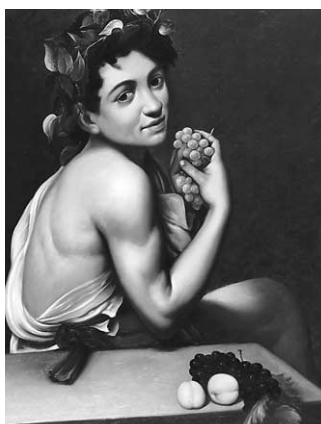
A self-portrait of Caravaggio as Bacchus. Honestly, he wouldn't last 10 minutes on The Sopranos .

This guy who, while troubled, ultimately found redemption