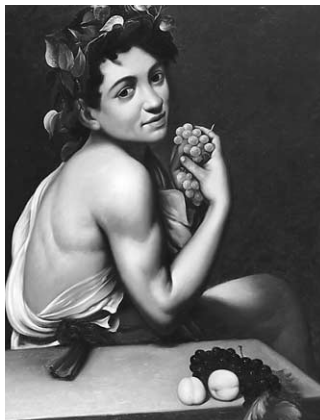
A self-portrait of Caravaggio as Bacchus. Honestly, he wouldn't last 10 minutes on The Sopranos .

He grew up in less than ideal circumstances. Most of his family died in the plague. Much of his youth was misspent on the mean streets of Rome. And as a