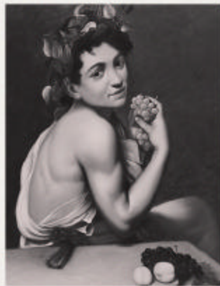
A self-portrait of Caravaggio as Bacchus. Honestly, he wouldn't last 10 minutes on The Sopranos .