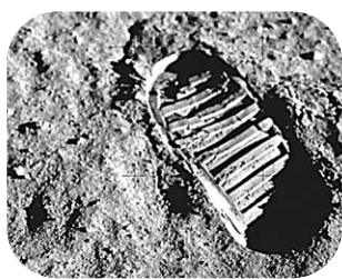
Armstrong left his footprints all over the jazz world. And he usually did it in lace-up oxfords.

It's a long way from the Apollo Theatre to the Apollo program. And while his playing may have been "as lofty as a moon flight," as Time magazine once suggested, that would be as close as Louis Daniel Armstrong would ever get to taking "one small step for man."