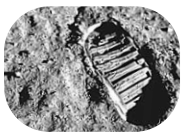
Armstrong left his footprints on the jazz world, wearing lace-up oxfords.

Alas, the arts are dismissed as extravagant in today's schools. This, despite all the studies that show parents believe music and dance and art and drama make