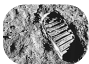
Armstrong left his footprints on the jazz world, wearing lace-up oxfords.

the trumpet was as a guest in a correctional home for wayward boys. If only today's schools were as enlightened and informed as that reformatory was.