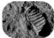
Armstrong left his footprints on the jazz world, securing lace-up ex-fords.

20th century, giant leaps were simply a matter of course for Satchmo. For no one has ever embodied the art form the way he did. It was he who helped make virtuoso solos a part of the vocabulary. It was he who was honored with the title "American goodwill ambassador" by the State Department. It was he who was the last jazz musician to hit #1 on the Billboard pop chart.