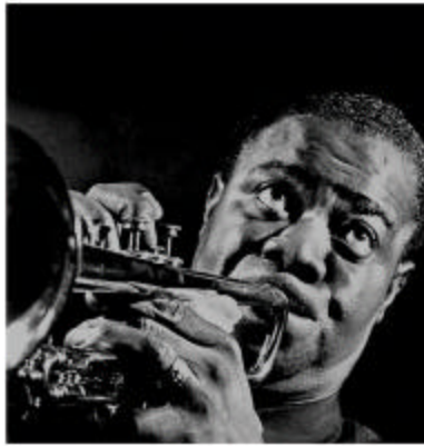
Instead of a giant leap, Louis Armstrong delivered one giant free-form crazy jazz groove for mankind.

20th century, giant leaps were simply a matter of course for Satchmo. For no one has ever embodied the art form the way he did. It was he who helped make virtuoso solos a part of the vocabulary. It was he who was honored with the title "American goodwill ambassador" by the State Department. It was he who was the last jazz musician to hit #1 on the Billboard pop chart.