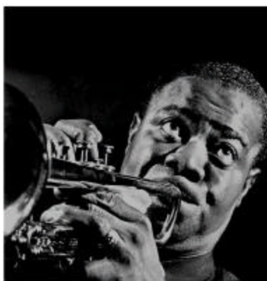
Instead of a giant leap, Louis Armstrong delivered one giant free-form crazy jazz groove for mankind.

Not bad for a kid whose first experience with