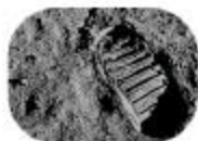
Armstrong left his footprints on the jazz world, wearing lace-up esofords.

It's a long way from the Apollo Theatre to the Apollo program. And while his playing may have been "as lofty as a moon flight," as Time magazine once suggested, that would be as close as Louis Daniel Armstrong would ever get to taking "one small step for man."