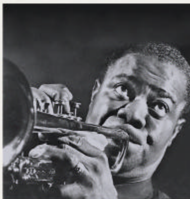
Instead of a giant leap, Louis Armstrong delivered one giant free-form crazy jazz groove for mankind.

20th century, giant leaps were simply a matter of course for Satchmo. For no one has ever embodied the art form the way he did. It was he who helped make virtuoso solos a part of the vocabulary. It was he who was honored with the title "American goodwill ambassador" by the State Department. It was he who was the last jazz musician to hit #1 on the Billboard pop chart.