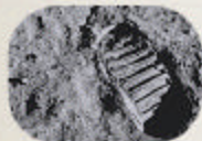
Armstrong left his fingerprints on the jazz world, securing lace-up solos.

AmericansForTheArts.org . Just like the great Louis Armstrong, all you need is a little brass.