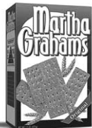
A misconception. Not to mention an overlooked marketing opportunity.

Hardly a fitting legacy for the woman who, despite getting a late start at the positively elderly age of 17, became