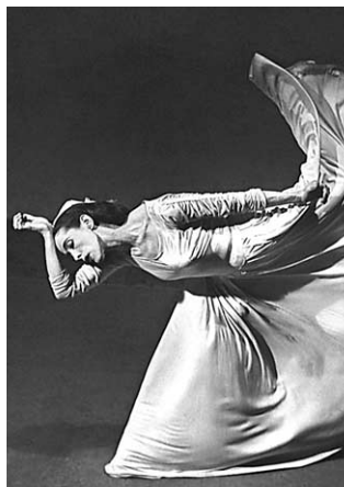
Ms. Graham told stories using movement. Here, she tells us how sad it is that kids aren't getting enough art.

She did nothing less than create an entirely new genre of dance, while