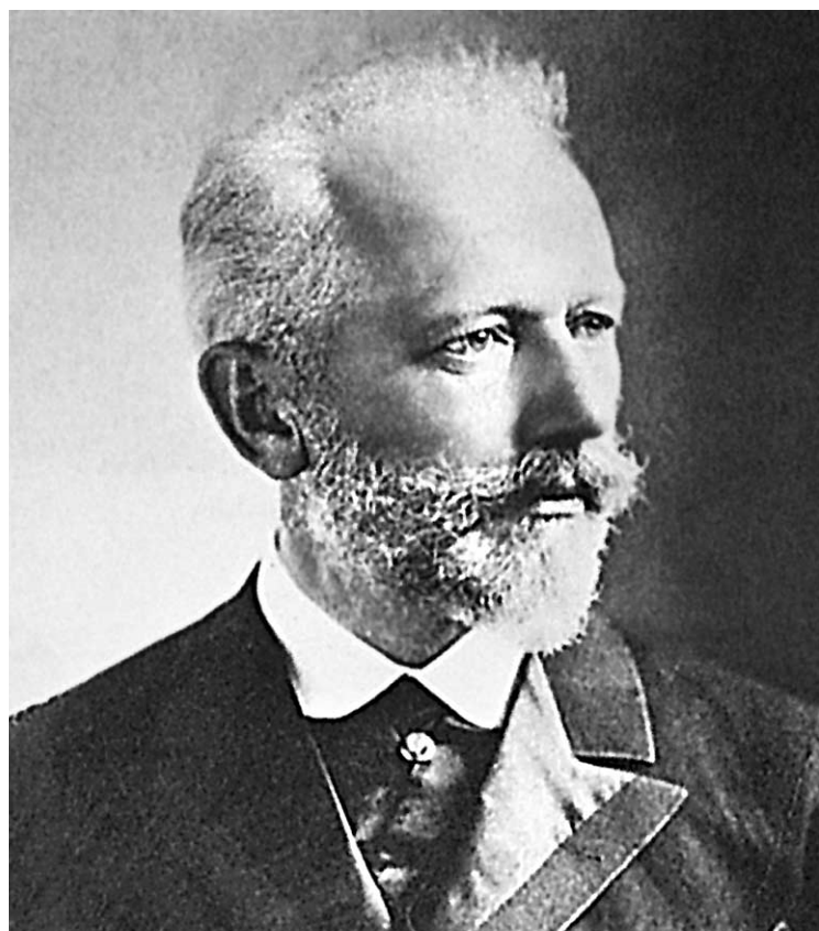
Among the many setbacks Peter Ilyich Tchaikovsky endured: a disapproving family, a loveless marriage, a blind barber.

Setbacks such as these could have finished a lesser man. Instead, they informed his work,