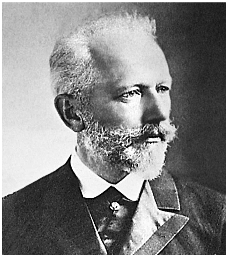
Among the many setbacks Peter Ilyich Tchaikovsky endured: a disapproving family, a loveless marriage, a blind barber.

Setbacks such as these could have finished a lesser man. Instead, they informed his work,