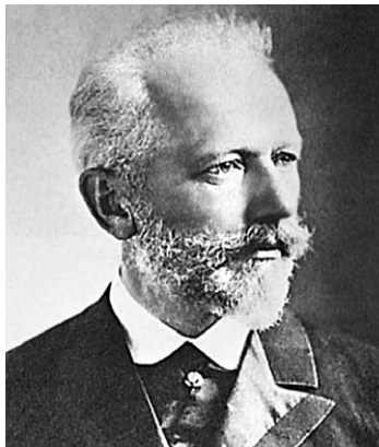
Peter Ilyich Tchaikovsky endured many setbacks, not the least of which was a blind barber.

even after he became world-famous. Setbacks like these could have finished a lesser man. Instead, they informed his work, which remains some of the best loved in history. Yet some kids will still confuse Tchaikovsky with a nasal spasm. Why? Because the arts are slowly but surely being eliminated from today's schools, even though a