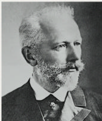
Peter Ilyich Tchaikovsky endured many setbacks, not the least of which was a blind barber.

Indeed, this great Romantic composer should be so immortalized. As a young man, he pursued a career in music at enormous personal risk and against his own father's advice. His mild temperament combined with his tendency to work too hard left him with insomnia, debilitating headaches and hallucinations. On top of that, Tchaikovsky's composition teacher never liked his work,