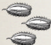
Fig. 1 Pollen

If one were to make a quick list of the world's favorite composers, despite his relatively recent vintage Peter Ilyich Tchaikovsky would be on it. After all, he did compose Swan Lake , which is perhaps the