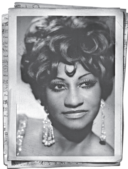
The undisputed Queen of Salsa. Funny, she doesn't look like a hot sauce.

as men. And when she immigrated to the United States, she joined forces with the Latin headliner Tito Puente. But it was in 1973 at Carnegie Hall when Celia burst onto the concert stage wearing flamboyant