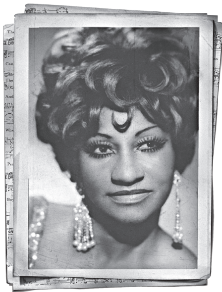
The undisputed Queen of Salsa. Funny, she doesn't look like a hot sauce.

But it was in 1973 at Carnegie Hall when Celia burst onto the concert stage wearing flamboyant