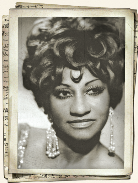
The undisputed Queen of Salsa. Funny, she doesn't look like a hot sauce.

as men. And when she immigrated to the United States, she joined forces with the Latin headliner Tito Puente. But it was in 1973 at Carnegie Hall when Celia burst onto the concert stage wearing flamboyant