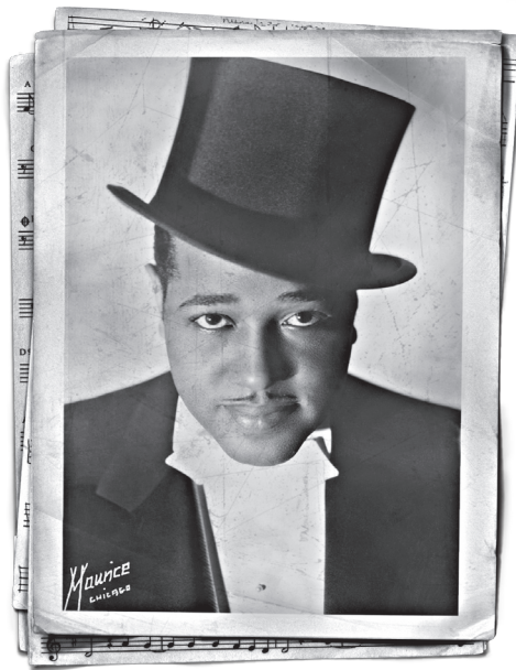
A piano player. A composer. An orchestra leader. Duke Ellington reigned over a land called Jazz.

His music spread across the world with songs like "Sophisticated Lady," "In a