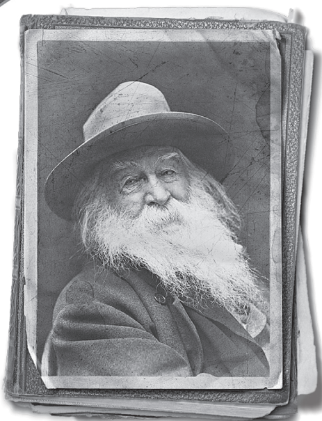
Whitman satisfied his sweet tooth with rich, wave-like verse. Every kid should make poetry a part of his diet.

The son of a Quaker carpenter, Walt Whitman grew up with an affinity for nature. This, along with his love for New York City, inspired him to write a truly original kind of poetry, the likes of