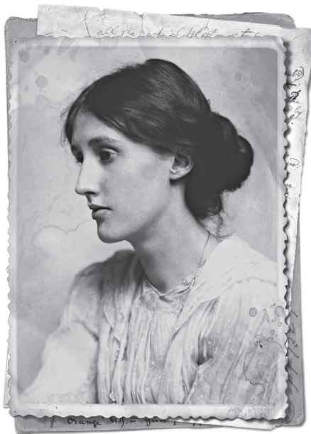
One of the world's most influential writers, Virginia Woolf. Novels writeris, not Camis lupus.

During the Post-Impressionist movement, Virginia was influenced to reject linear writing. Her most well-