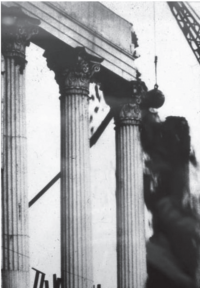
Charleston Hotel, demolished in 1960

The city should be a place where every citizen's heart can sing. In the art of city-making, we should first seek to make no mistakes. This was a mistake: They demolished the Charleston Hotel, where the Democratic Convention of 1860, 150 years ago, met. They demolished it in 1960 because city leaders were convinced that in order to be a great city, you had to have a drive-in motel—there wasn't a great city without a drive-in motel.