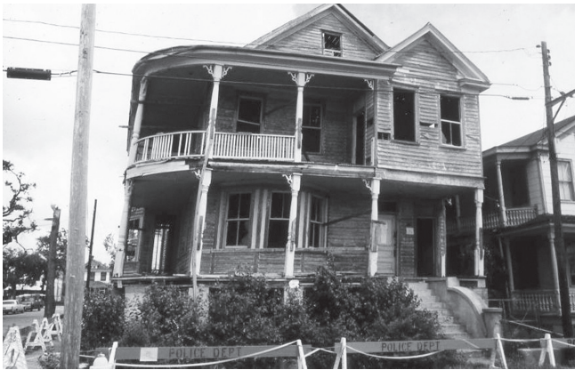
17 Fishermen Street, before and after