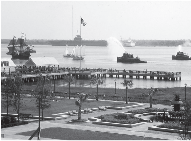
Charleston's Waterfront Park

did a plan. And we got this wonderful residential development [changes slide] . And I needed a good use in front of the Pineapple Fountain. The Pineapple Fountain was like a little Italian campo, you know. And so it couldn't be residential there.