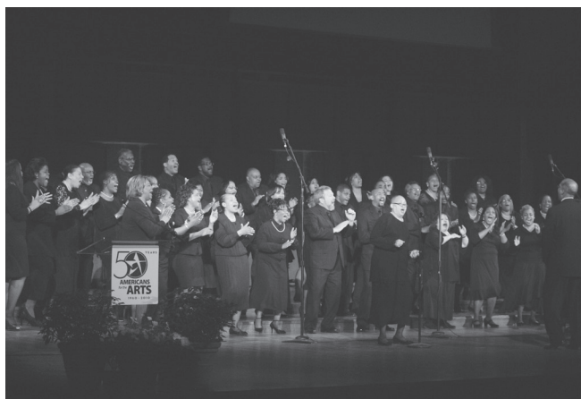
The Washington Performing Arts Society's Men and Women of the Gospel Choir