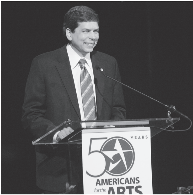
Sen. Mark Begich (D-AK)