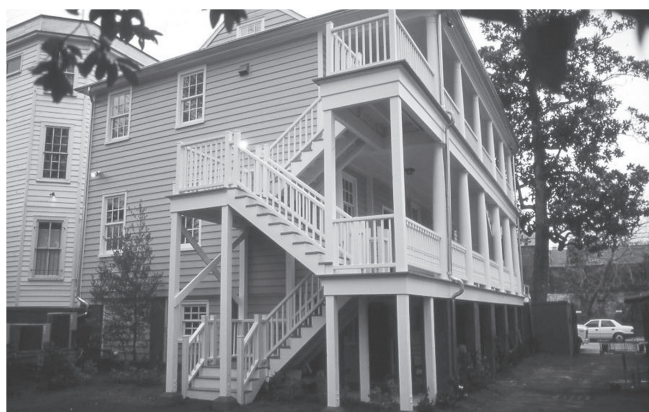
One of Charleston's award-winning public housing sites

We won an award from the president of the United States: 25 years worth of federally funded projects, buildings, bridges. Eleven awards for 25 years. They gave housing for the poor one of those awards. When Prince Charles came to Charleston, the only photo op we wanted was in front of these. He said that the best lesson that Charleston, SC, had to share with the rest of the world was that an architect could build beautiful buildings for poor people.