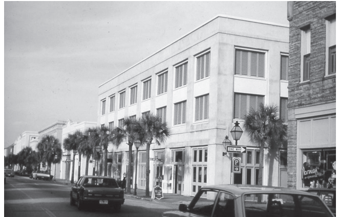
Charleston's award-winning parking garage on East Bay Street

I said, "Well, not if we barricade the street." Now, what we all knew was that this part of our town was really struggling. So if