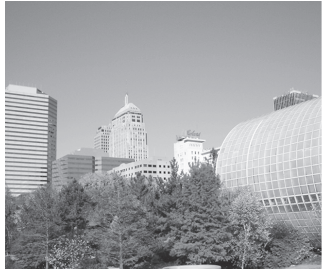
The Oklahoma City National Memorial and Museum

When we were building our Waterfront Park, the first part we did was rebuild an old pier while the other part of the park was being worked on. And I thought that all this has fallen in the mud [changes slide] . And I thought they needed a rail around it. And the architect said, "No, you don't. Just put the stones back like that and no one will fall in the water. And they