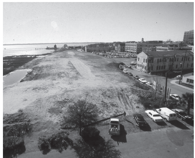
Charleston's coast before the Waterfront Park renovation

Then the private development always follows a great public realm in city-building. You build up great public venues and investments, and then the private comes. So we worked and