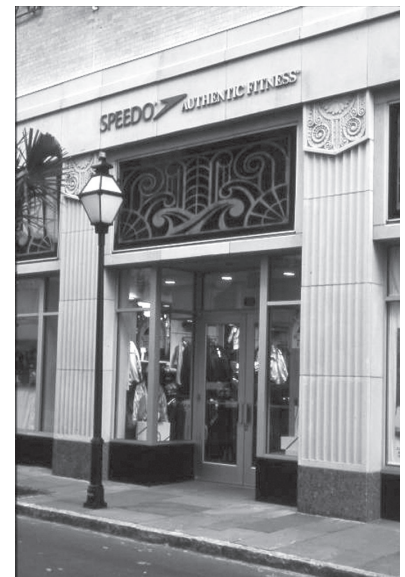
Storefronts and the restored theater along Market Street in Downtown Charleston