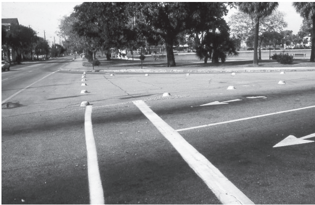
A renovated intersection of Broad St. and Rutledge Ave. in Charleston