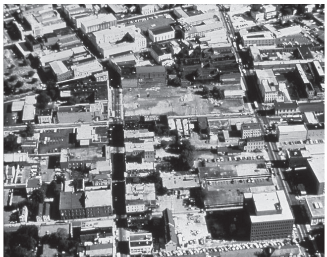
Downtown Charleston, SC

But Market Street was coming back. And so we had some energy, but we had to continue that energy by connecting Market Street to King Street. Human beings do not walk past a vacant lot in an urban space. They will never do it. It's unnatural. So we had to put a lot of energy there. But we had to be very careful. You know, so often in city-building, people will say, you