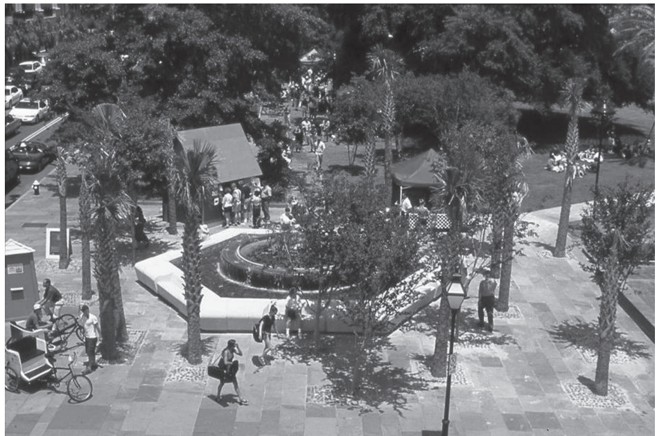
One of Charleston's many parks.