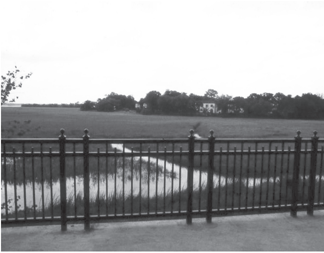
View from Charleston's baseball stadium

V isioning is so important, putting a new bridge on one side of the peninsula. There was never a bridge before. And connecting an old main street, an east-west street, that ran from water to water, Calhoun Street, so bringing a lot of people into the city on one end. And then we're building the aquarium on the other end.