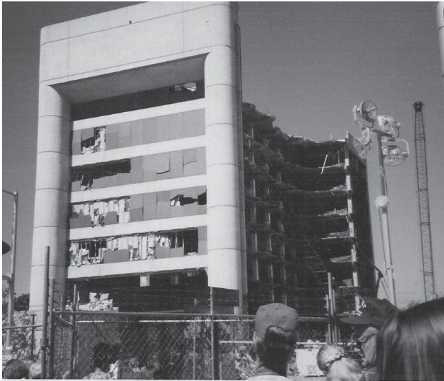
The Alfred D. Murry Federal Building in Oklahoma City

I challenge all of us in our country to take the Mayors' Institute on City Design to scale, to create a movement, to get everyone involved, to build on President Obama's wonderful commitment to a national urban and metropolitan policy. Let's have a White House conference on the arts and the art of city-building. Let's get everyone involved, every city, every governor, every state DOT, every school district, every corporation, everyone who has the opportunity to touch or to impact—to make a decision—about a city. And let's do it with the new understanding and appreciation that our nation's success—cultural, social, and economic—depends upon how great our towns and cities are.