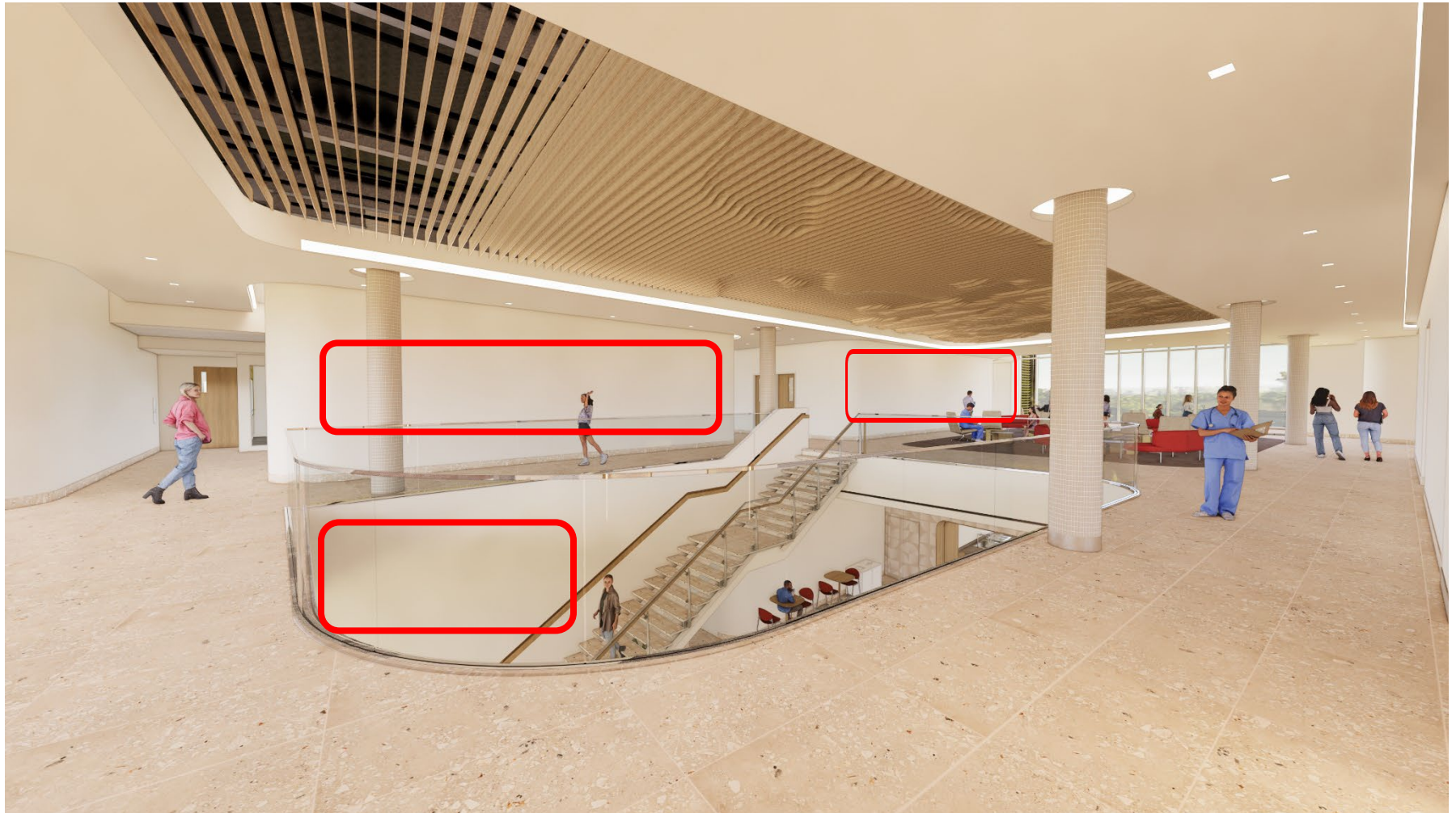
Rendering of new second floor in Kristensen Rural Health Education Complex, view from southeast of the staircase.