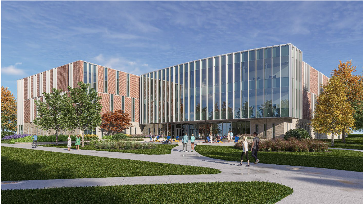
Exterior view of the Kristensen Rural Health Education Complex.

RFQ Submission Deadline: May 13, 2024 Total Budget: $150,000