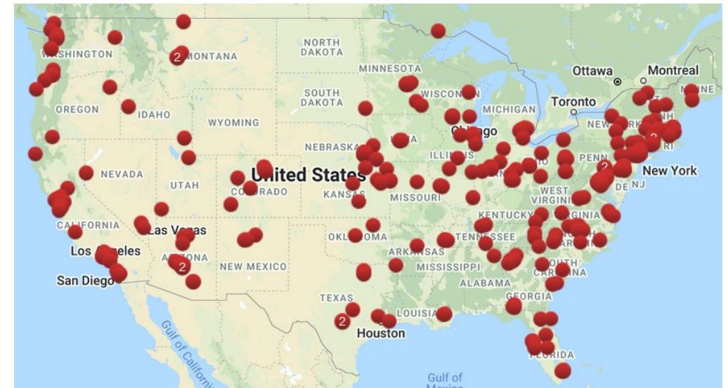
Respondents Locations by Zip Code